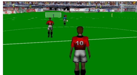
(a) soccer game

The soccer player agents each have a simple cognitive loop based on the extended BDI model described in [6], which may be summarized as sense, think, act . 8